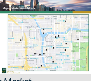
Survey the Market